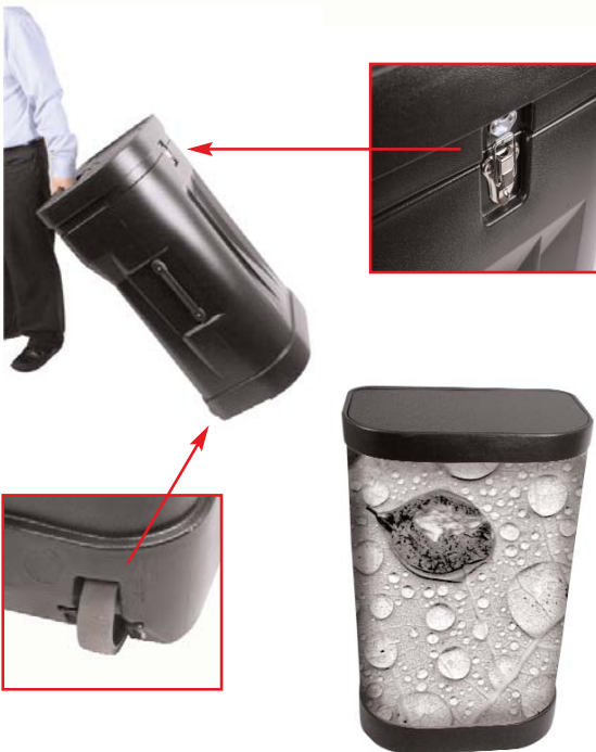
Example of case with conversion wrap